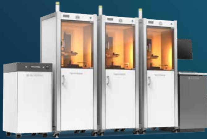
Figure 4 3D printing is ideal for when you require high-speed, high-volume 3D printing of smaller-sized production-grade clear parts. In addition to print speed, Figure 4 maximizes productivity with a short post-cure step that does not require thermal curing. You can also densely pack or nest parts into the build chamber in the most convenient orientation without sacrificing part isotropic properties.