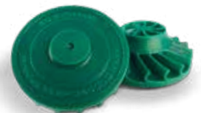
Customized components or short run production without the cost and delay of tooling

Streamline your file-to-pattern workflow with the advanced 3D Sprint® software capabilities for preparing and managing the additive manufacturing process, unattended high speed printing and a defined and controlled post-process methodology. Multijet Printing ease-of-use and dependable process ensures reliable performance, yield and results.