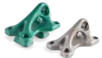
Deliver better performing, more cost-effective components with topology optimization and part consolidation.