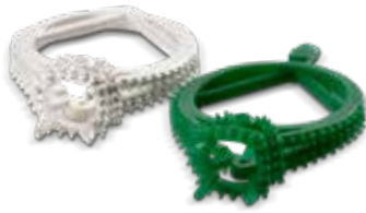
Figure 4 JCAST-GRN 10 is a green material, ideal for small, fine-featured jewelry master patterns for gypsum investment casting applications. This material leaves minimal ash after burnout to produce superior casting quality. Create and produce custom jewelry or other investment castings that capture fine detail with a smooth surface finish.